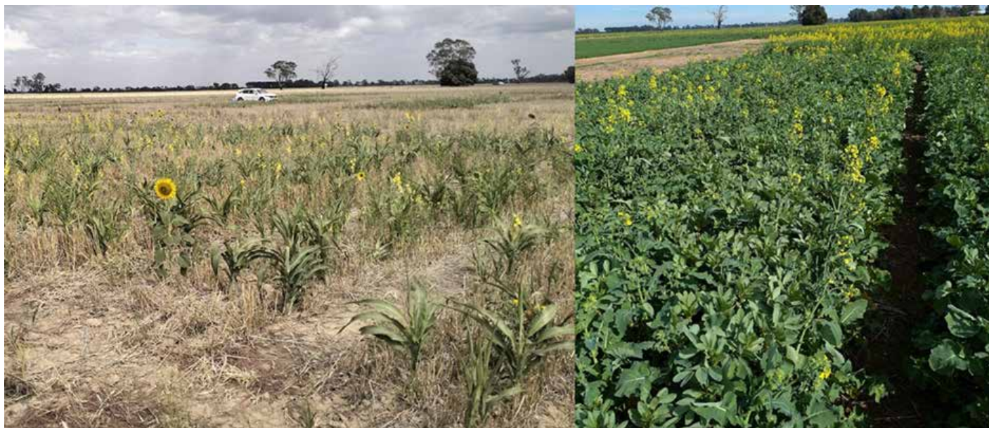
Figure 3. Summer cover crops (left) and intercropping (canola and faba bean, right) are two practices that can potentially build soil carbon. Photos from the Soil CRC Burramine (Victoria) long-term summer cover crop and intercropping trials. (Source: A. Gibson).

Maintenance or improvements of soil carbon are important for maintaining soil health. Good soil health supports nutrient cycling, soil structure and water holding capacity (Figure 3). Linking this to managing for plant growth, you can establish positive feedback that increases the productivity of your system. These links are evident in the ERF, as all the eligible activities are good agronomic practices.