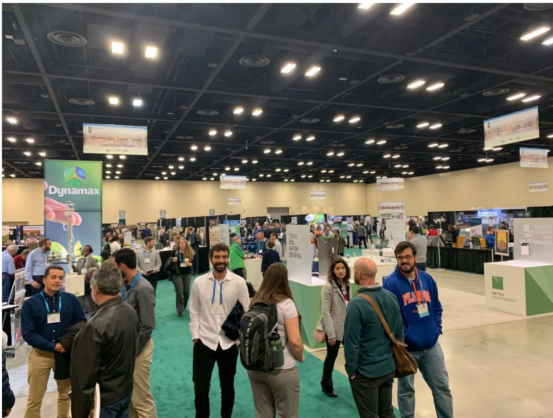
At the Soil Science Society of America conference in San Antonio